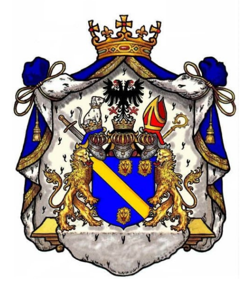
Bishop (TCAZH), Abbot (OC), Scion of the House of Knott-Brunswick.

The Christ's Assembly at South Holland (ZH). Ecclesiastical Order of the Culdee, Barendrecht Abbey (OC).