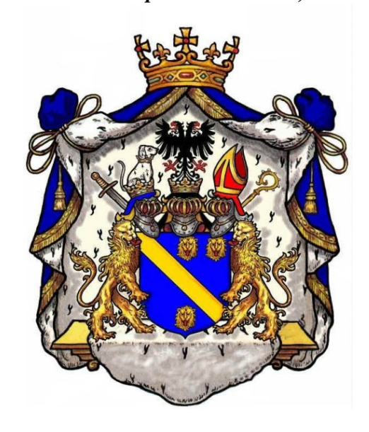
Bishop (TCAZH), Abbot (OC), Scion of the House of Knott-Brunswick.

The Christ's Assembly at South Holland (ZH). Ecclesiastical Order of the Culdee, Barendrecht Abbey (OC).